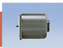
Variable speed motor Unit Type Speed Control Motor